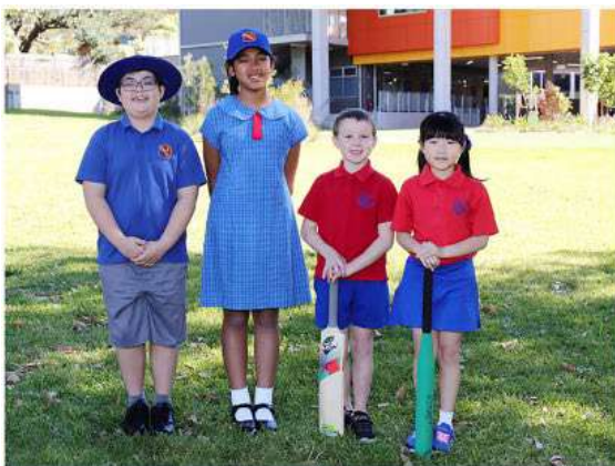
Summer Uniform & Sport