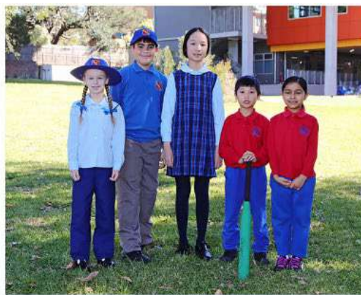
Winter Uniform & Sport