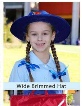
Wide Brimmed Hat